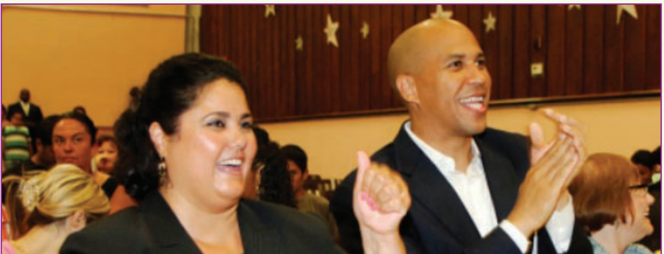
Mayor Cory Booker and school administrator at Luis Muñoz Marin Middle School

"That's why I'm so excited about Classroom, Inc., because it really is, to me, all about a combination of skills working together, in concert, for success."