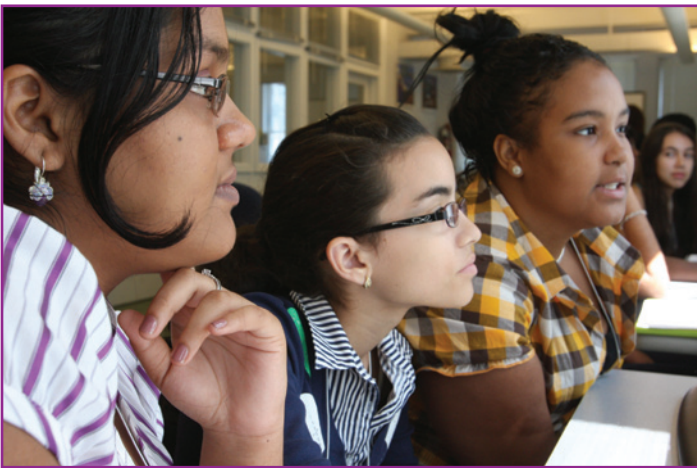
Eighth graders gather information to make a management decision in The Kalliope Performing Arts Center.

"[Students'] motivation was exceptionally high! They couldn't wait to learn a new banking skill, practice their math and use problem solving skills." —5th and 6th grade teacher, Thomas Jefferson Elementary